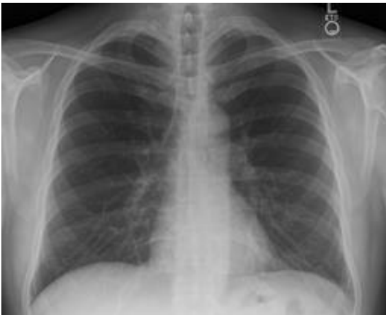
Photograph 1 Normal x-ray