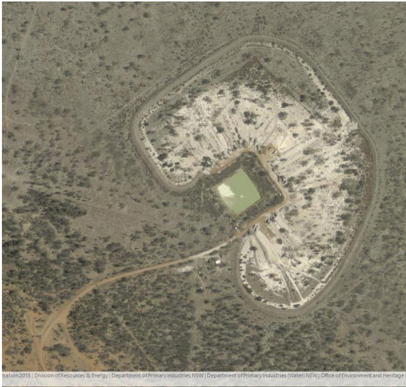
LRMA Tank 4 with 36 available sites for individual members