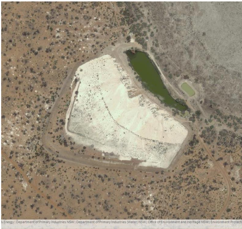
LRMA Tank 5 with 39 available sites for individual members